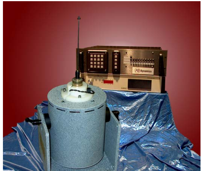
Electromagnetic Chuck (EM Chuck)

MB's EM Chuck and Intelligent Power supply allow you to selectively connect/disconnect one or more exciters during different tests to excite just in the vertical direction, or just at an engine mount, or just for 2-3 principal modes, or to support other test program objectives.