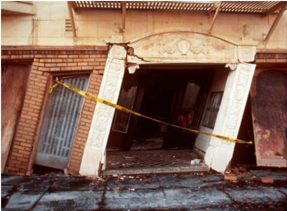
Real-world vibration is always multi-axial

Vibration sensors are designed to measure motion in one principal axis, usually perpendicular to the mounting base. But an accelerometer or velocity pick-up's output in mV or pC is contaminated by motion in other directions. The transverse effect varies depending on the direction of side vibration. Transverse sensitivity refers to such output caused by cross-axis motion, expressed as a % of the nominal sensitivity with direction dependence.