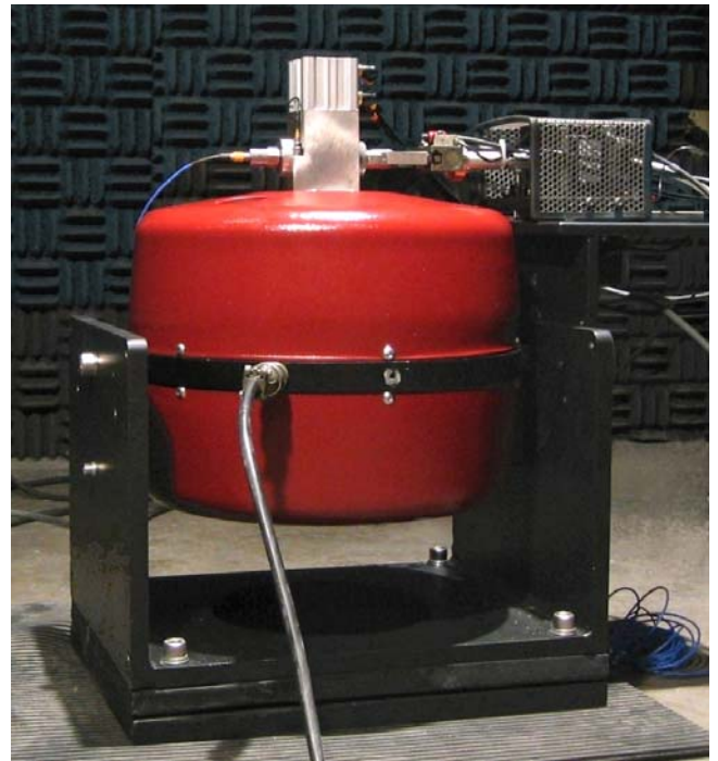
CAL 110 Exciter with TS Fixture and TS Rotator