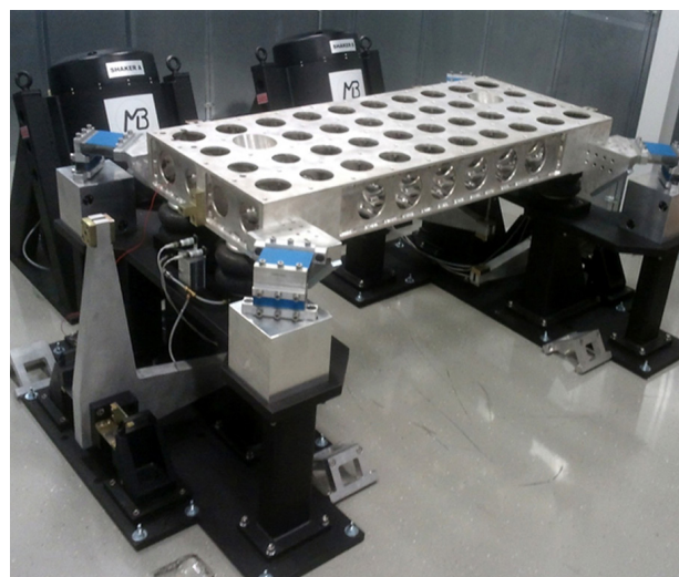
Vertical & Roll Excitation, 4 DOF Mode

Buzzes, squeaks and rattles in vehicles are a major source of customer dissatisfaction, complaints in J.D. Power surveys, and warranty claims and costs. MB Dynamics delivers affordable turnkey systems to help OEMs & their suppliers develop and produce vehicles free of squeaks & rattles, with measurable quality. VPR+4D can be used for product validation during design/development as well as for production verification, launch support, and in-plant quality audits.