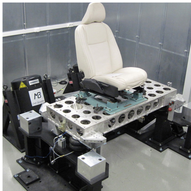
Vertical Pitch Roll (VPR) Mode