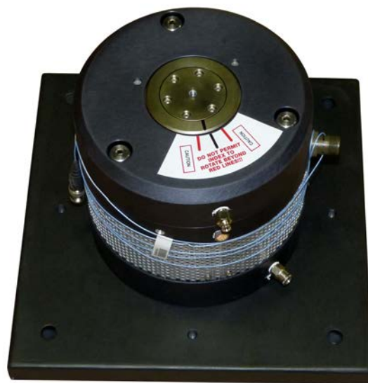
High-Frequency Air Bearing Calibration Vibration Exciter Model CAL25HF