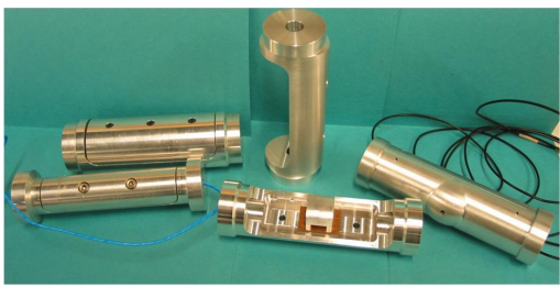
NIOSH Instrumented Handle